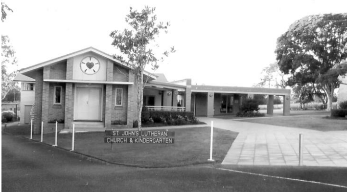
Church Hall with extensions