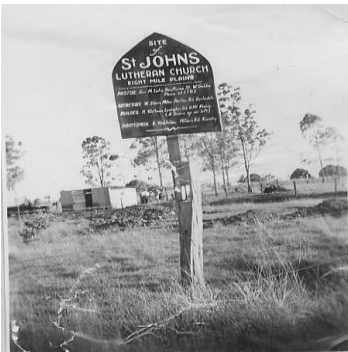
Sign indicating the Church Site