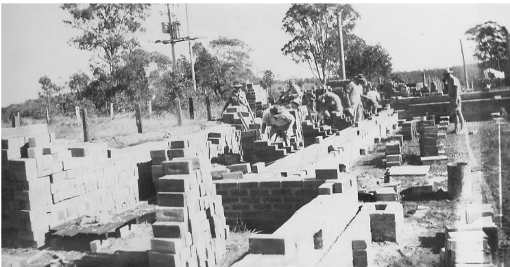
Brick construction underway